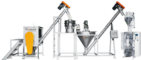
Protein Mix Processing Plant