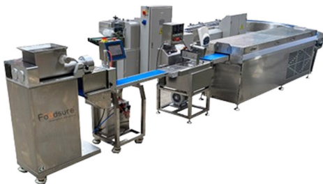
Energy Bar Plant