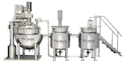
Pickle Processing Plant