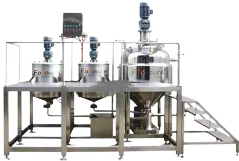
Mayonnaise Processing Plant