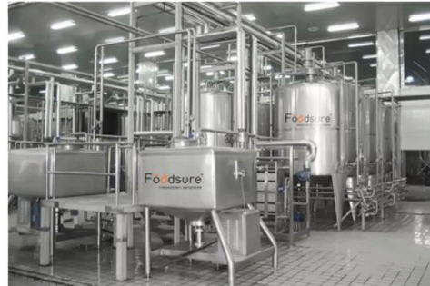
Tomato Puree Processing Plant