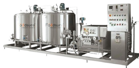
Non Dairy Whipped Cream Plant