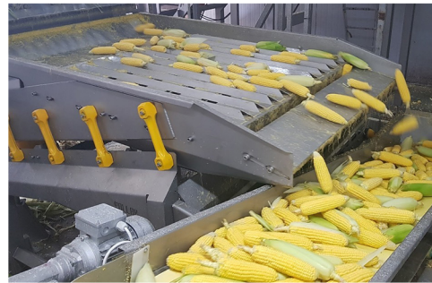
Sweet Corn Canning Processing Plant