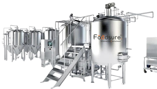
Tomato Ketchup & Sauce Processing Plant