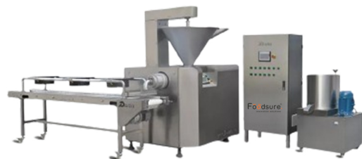
Protein Bar Processing Plant