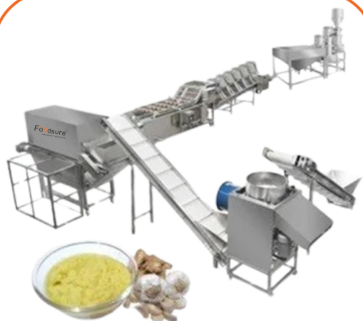
Ginger & Garlic Paste Processing Plant