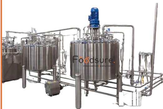
Beverage Processing Plant